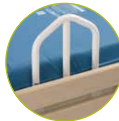
With side rail down