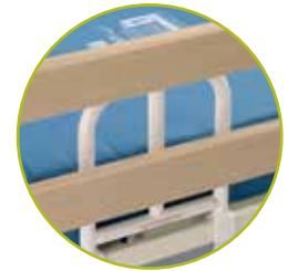
With side rail up