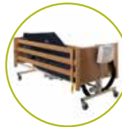
Side Rail Height Extension