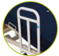
Bariatric Grab Handle